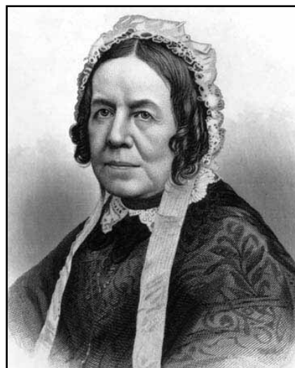
Sarah Josepha Hale